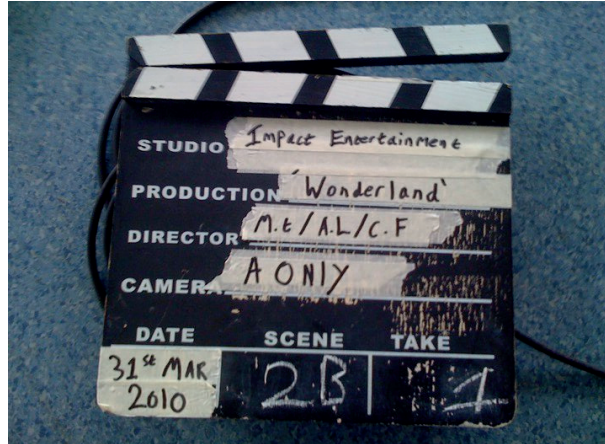
Figure 4: A traditional clapperboard