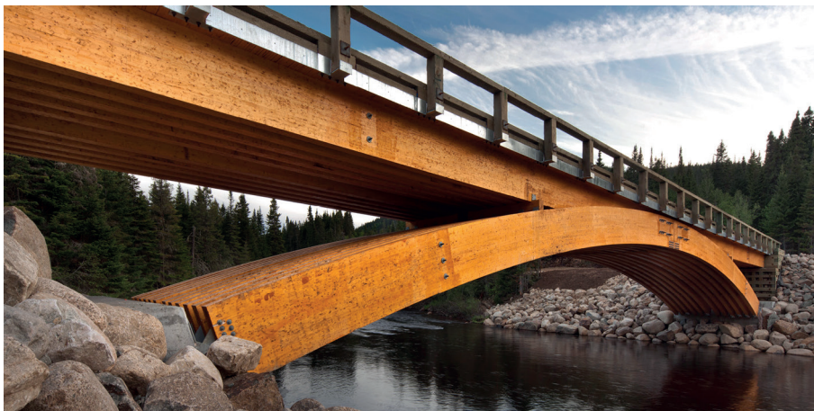
Figure 7: A timber bridge

In other cases, bridge designers have used traditional materials such as wood. Figure 7 shows a timber bridge in Canada.