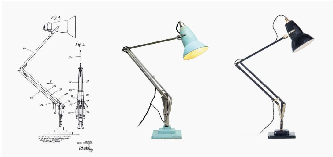
Figure 5: The Anglepoise lamp