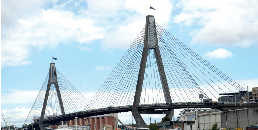
Figure 6: The Anzac Bridge