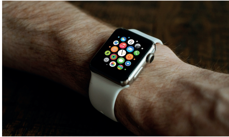
Figure 8: A smartwatch