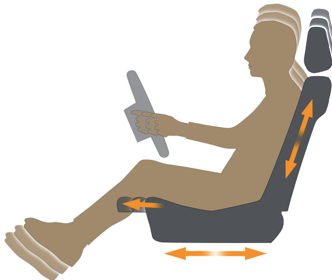
Figure 2: 2D graphics of the ergonomics of an interior