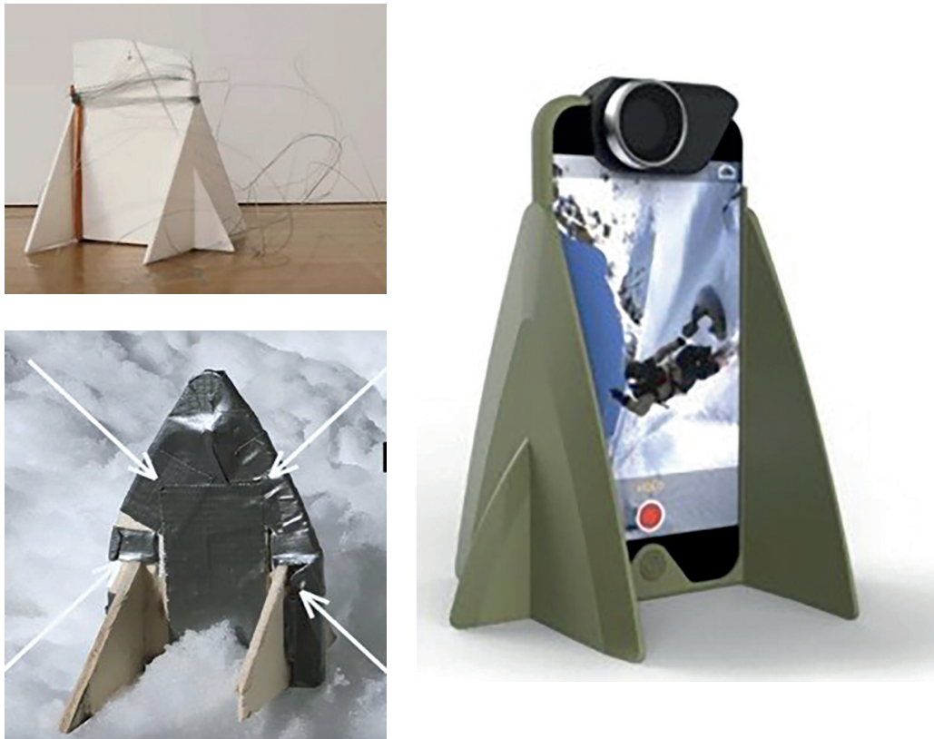
Figure 9: Different iterations of the Centriphone