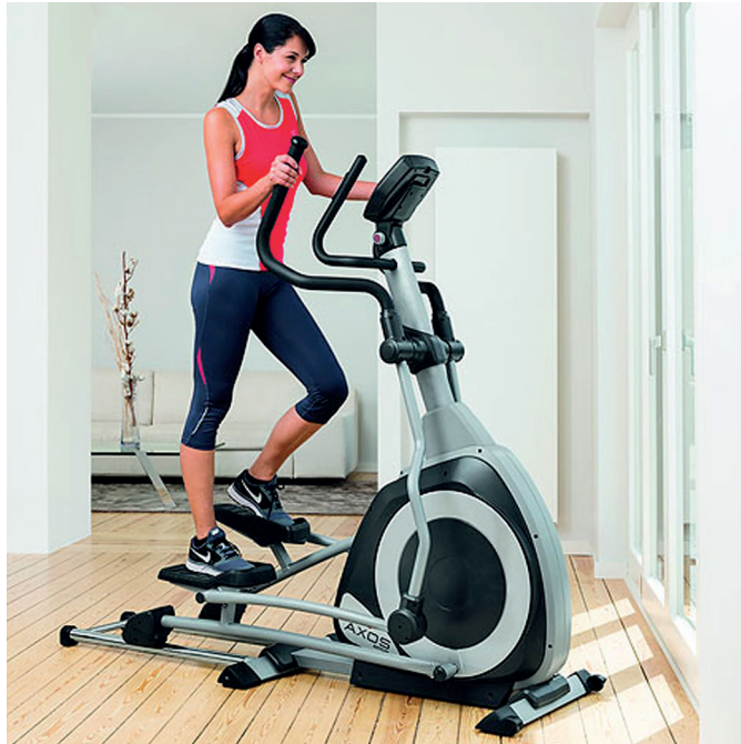
Figure 1: A woman on an exercise machine