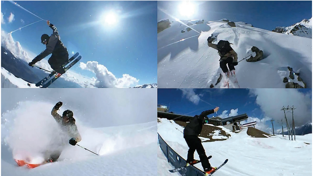
Figure 10: A skier using the Centriphone