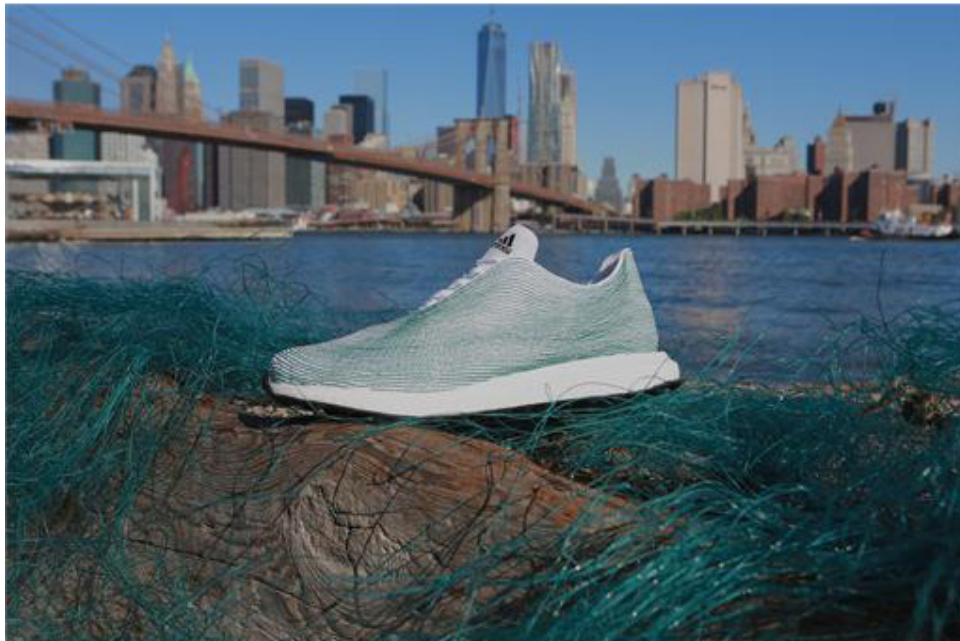
Figure 2: Adidas x Parley shoe