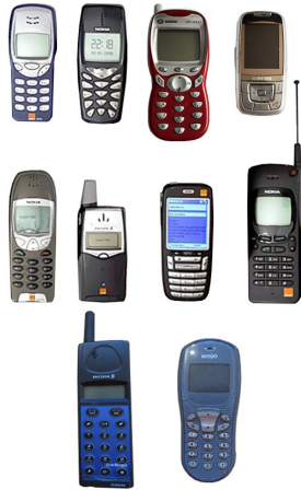
Figure 7: The evolution of mobile phones before the launch