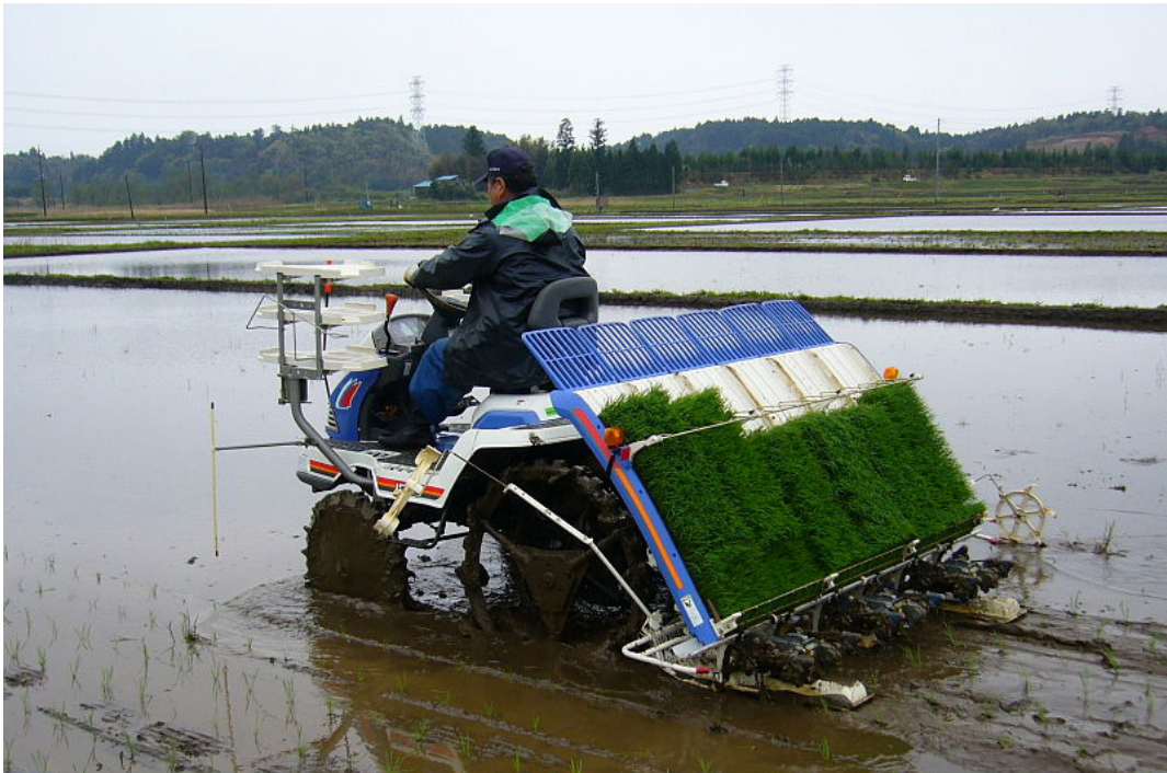
Figure 5: A farmer planting rice