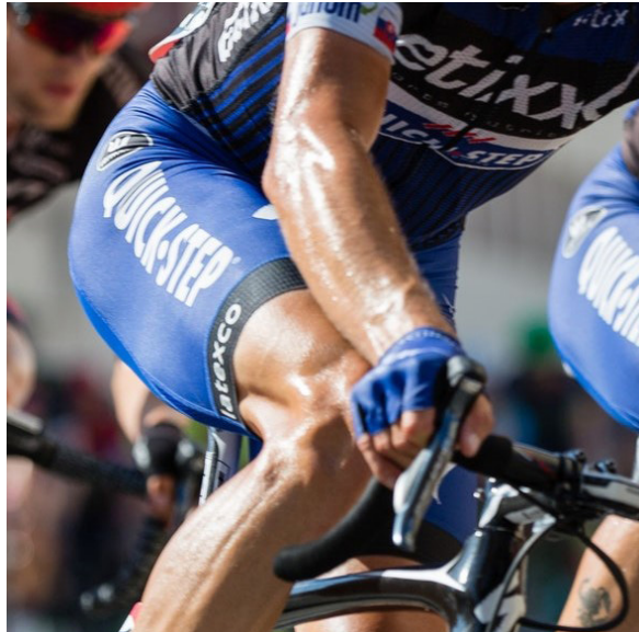
Figure 4: Cycling shorts

State the type of textile used in these cycling shorts.