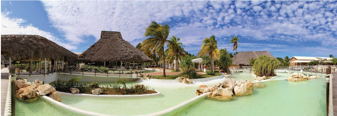
Figure 1: Beach resort in South Africa

The hotel serves a large number of international guests, who fly in at different times of the day. With the traditional metal key system, staff needed to be at the check-in desk for 24 hours a day, seven days a week to give guests the key to their room. To overcome this, Seaview Cottages has recently invested in a new mobile key system, called Digital Keys.