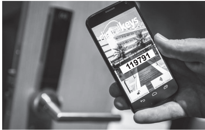
Figure 4: The Digital Keys app interacting with the hardware in the door